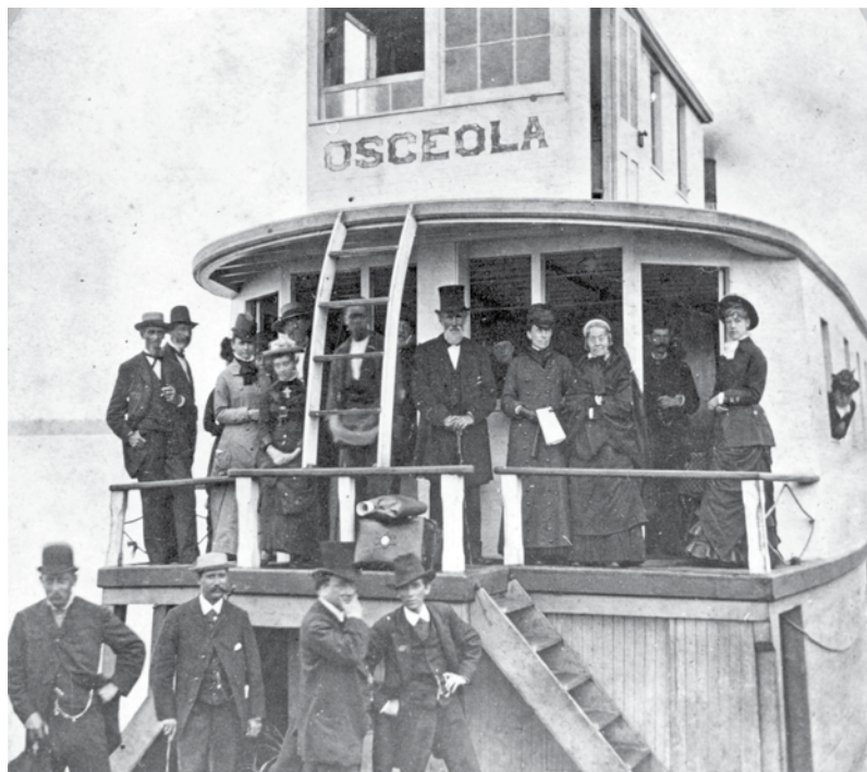
State Archives of Florida

http://www.theriverreturns.org/explore/history/text/19/