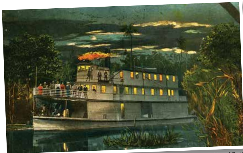
State Archives of Florida

These boats, which were propelled through the water by a turning paddlewheel that was pushed by a steam-powered engine, were great at moving along the river because they were able to navigate shallow water. Paddlewheel steamers were very important in Florida's history, because they made it much easier for people to travel to the inland parts of Central Florida. Before steamboats were used, most of the action in Florida happened along the coasts because sailing ships could not travel inland.