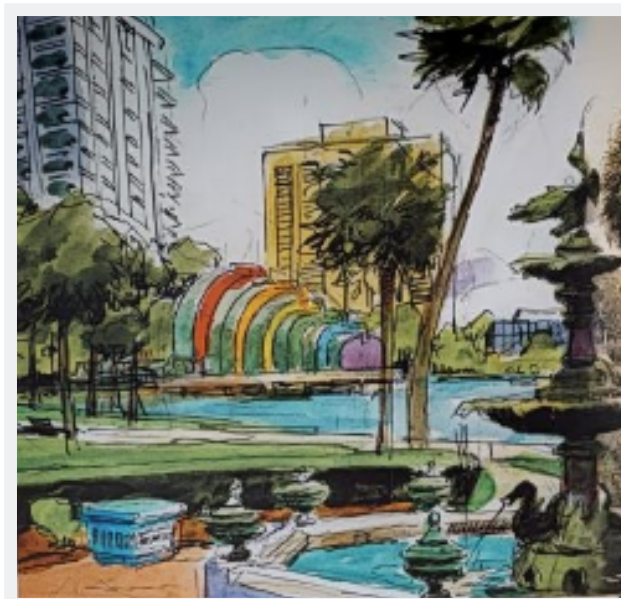
Photo Timeline Autobiography

Grab your favorite coloring supplies and some paper, and sketch the view from your window or your front porch.